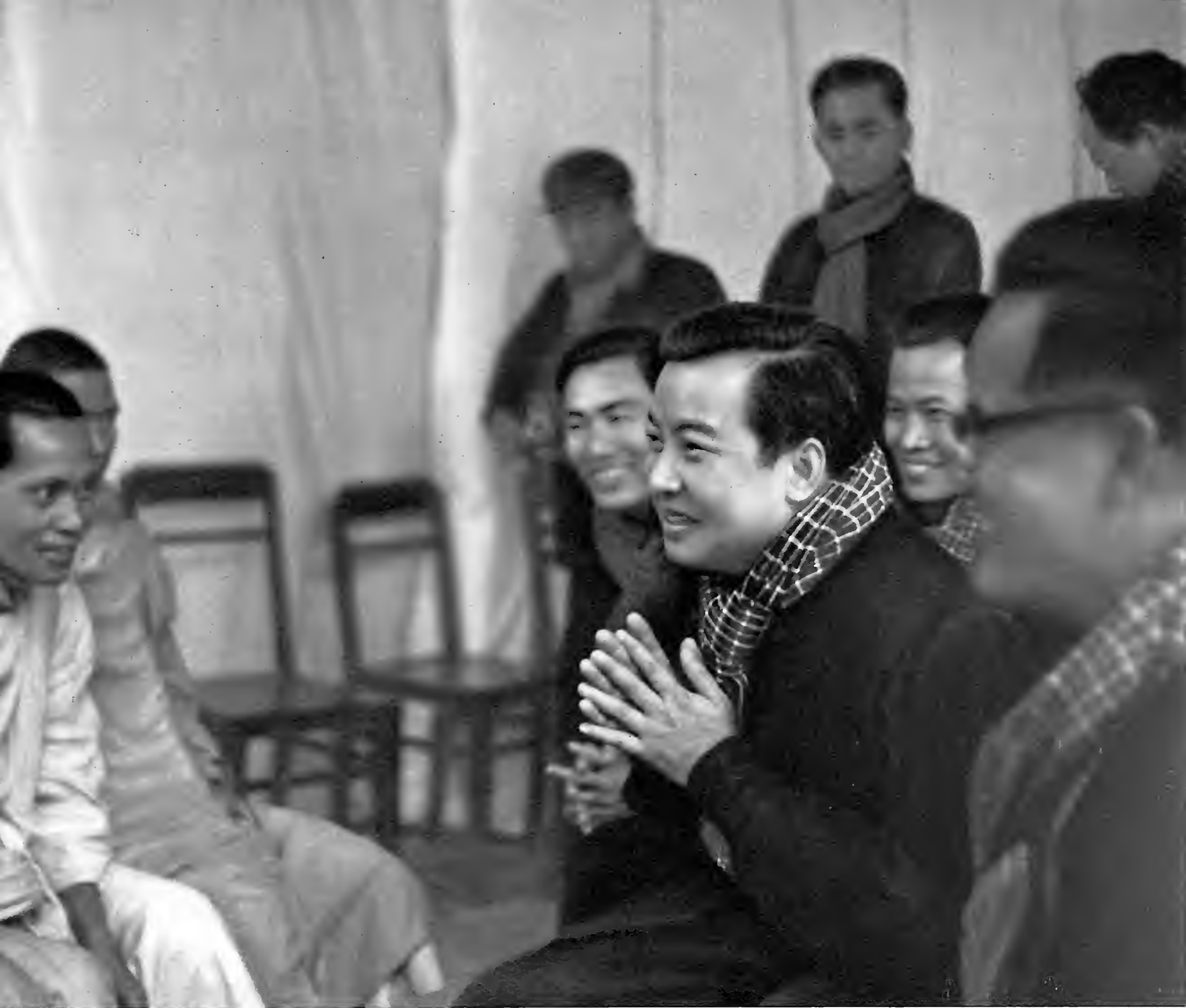
Buddhist monks delegation blessing the Head of State. With him are the three heroes, Khieu Samphan, Hou Yuon and Hu Nim.